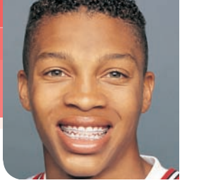
Clarity <sup>™</sup> Ceramic Braces